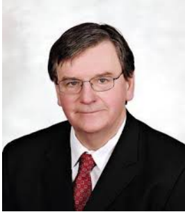
Hon. Gar Knutson P.C. Chair, Canada Turkey Business Council Owner, Knutson Law Professional Corporation

The Honourable Gar Knutson P.C. is a former Member of Parliament (1993-2004) and Cabinet Minister who served as Minister of State for Foreign Affairs and International Trade under two Prime Ministers (2002-2004). Mr. Knutson specializes as a lawyer and advisor assisting companies new to the Canadian market as well as advising foreign governments and Embassies in Ottawa as to the impact of domestic policies on their strategic objectives. His clients have included (from the public record) Embraer Aerospace (Brazil), the Embassies of Turkey, Saudi Arabia, and the United Arab Emirates, as well major corporations in the United States and Canada.