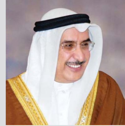
H.E. Shaikh Khalid bin Abdulla Al Khalifa Deputy Prime Minister Kingdom of Bahrain

We are pleased to invite you to participate in the Ninth Bahrain International Property Exhibition and Forum, BIPEX 2016, held under the patronage of H.E Shaikh Khalid Bin Abdulla Al Khalifa, Deputy Prime Minister, Kingdom of Bahrain.